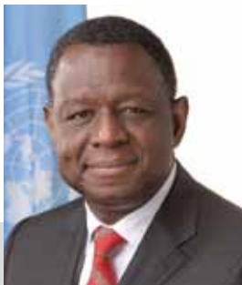
Dr Babatunde Osotimehin Executive Director of the United Nations Population Fund (UNFPA)

On December 12 th 1991 the two businessmen founded DSW (Deutsche Stiftung Weltbevölkerung). Their motives continue to guide our work today: to facilitate access to sexual and reproductive health education and family planning for all women, men and young people in the world's poorest countries. Shaped by the entrepreneurial spirit of the two founders, our activities are focused on helping people to help themselves through capacity building. In 1998, the two founders were awarded the Federal Cross of Merit for their work. They continue to play an active role on the Board of Directors and energetically support the foundation's activities.